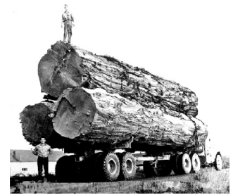
Timber Measurements Society