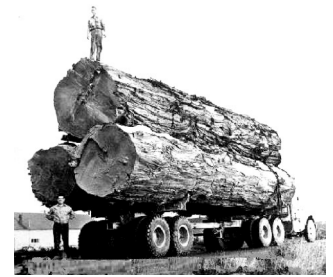
Timber Measurements Society