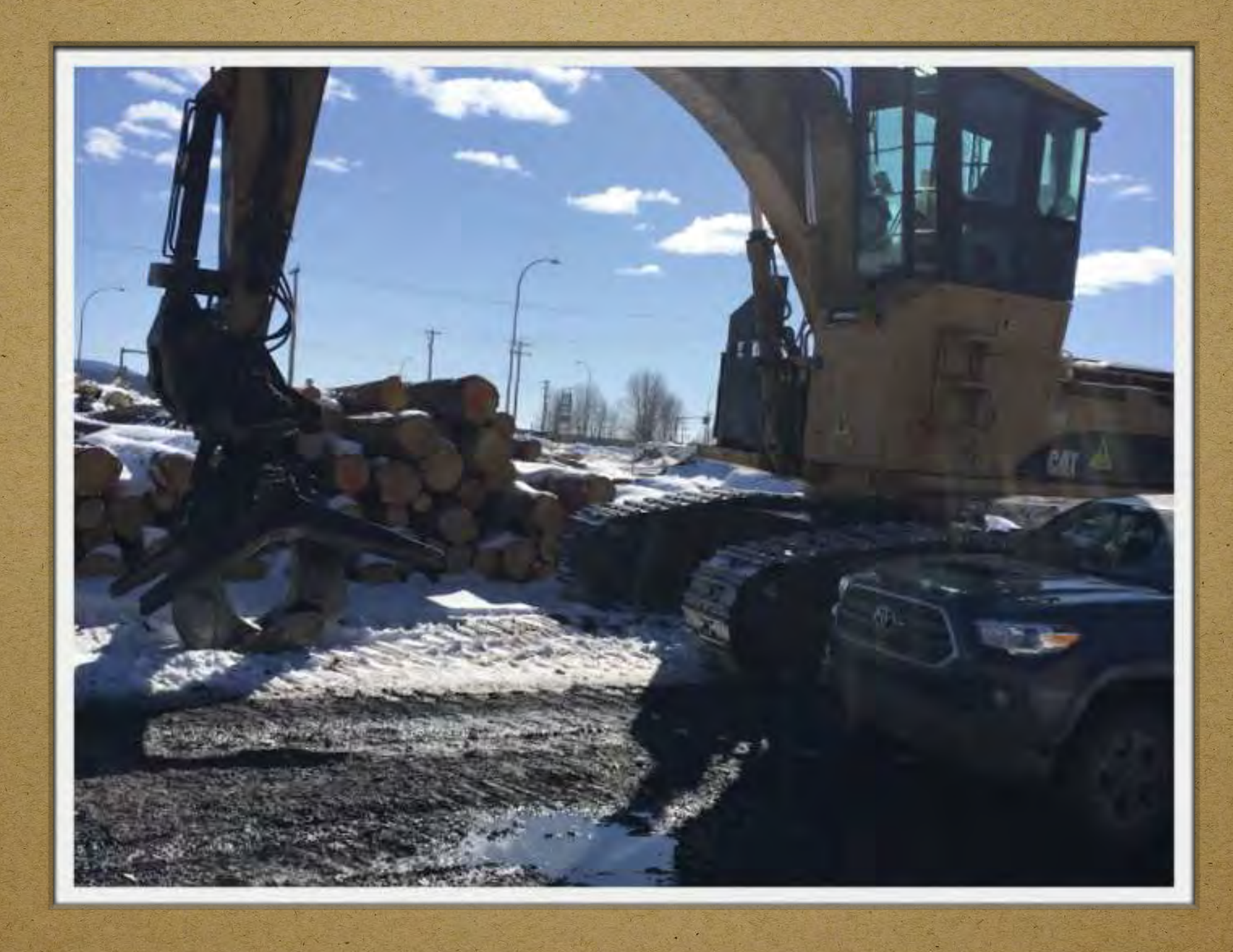
Man vs Machine