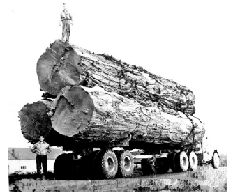
Timber Measurements Society