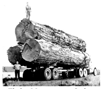
Timber Measurements Society