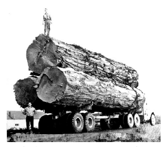
Timber Measurements Society