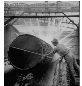
Timber Measurements Society