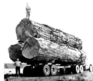
Timber Measurements Society