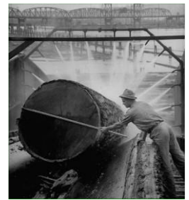
Timber Measurements Society