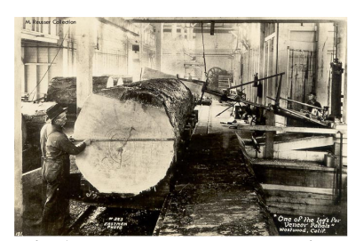
Timber Measurements Society Intermountain District Spring Meeting